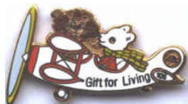
No 3 Rupert & Lion in aeroplane Red/White/Blue plane body © 2006