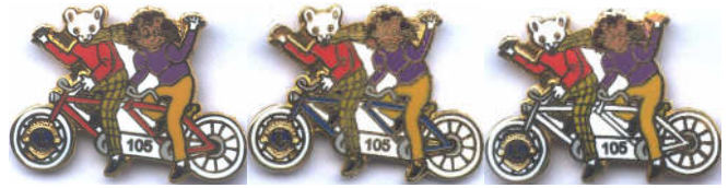
No 5 Rupert & Lion on a Bicycle Red/White/Blue cycle frame © 2008