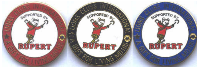
No 1 A Gift for Living circular set Red/Blue/Black rims © 2004

"Alone we can do so little; together we can do so much." — Helen Keller