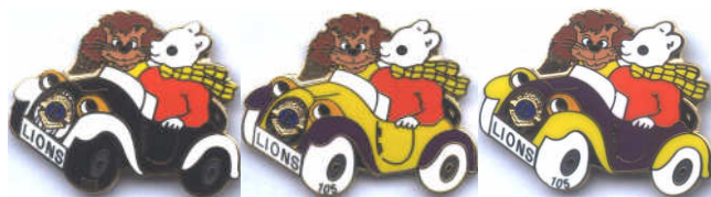
No 2 Rupert & Lion in car Yellow/Purple/Black car body © 2005