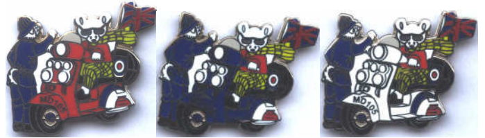
No 6 Rupert & PC Growler on moped red/white/blue available soon