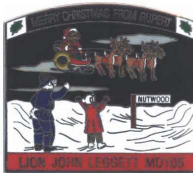
also No 3 Christmas NIGHT & DAY © 2006