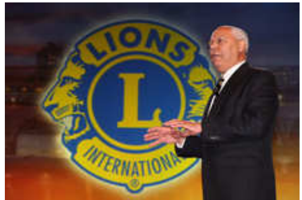
Colin Powell spoke as the keynote speaker on Wednesday morning about volunteerism.