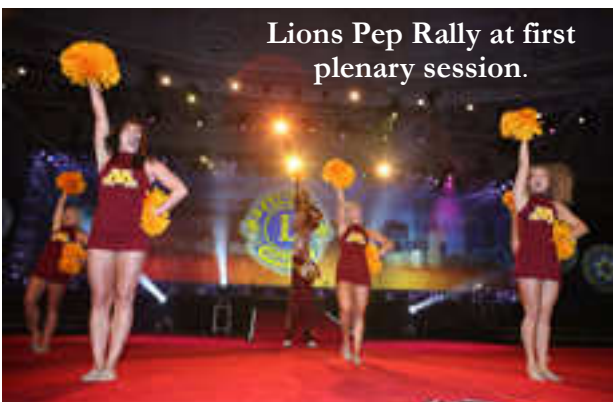
Lions Pep Rally at first plenary session.