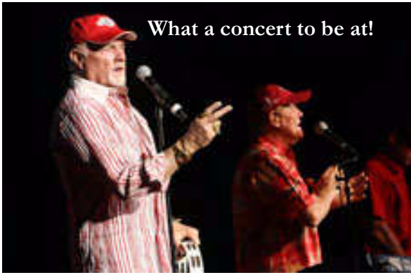
What a concert to be at!