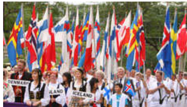
Parade on Nicolett Mall — Scandinavia & British Isles