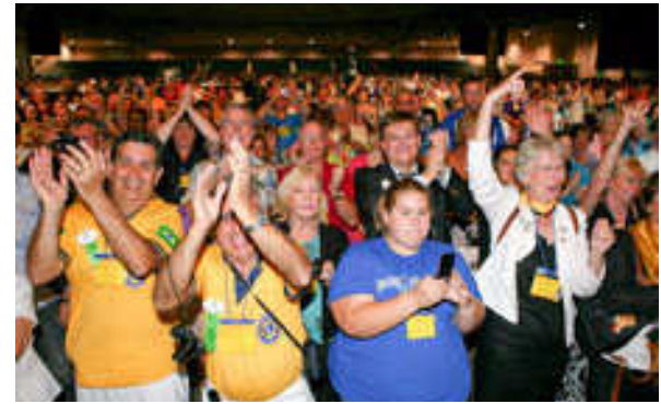
The crowd loved 'em!