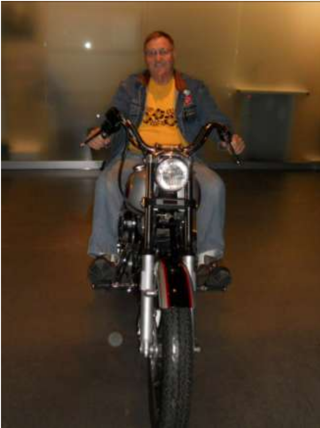
Blazing New Trails at HD museum, Governor Brian is "blazing new trails" at the Harley Davidson Museum in Milwaukee the day before the USA/Canada Forum