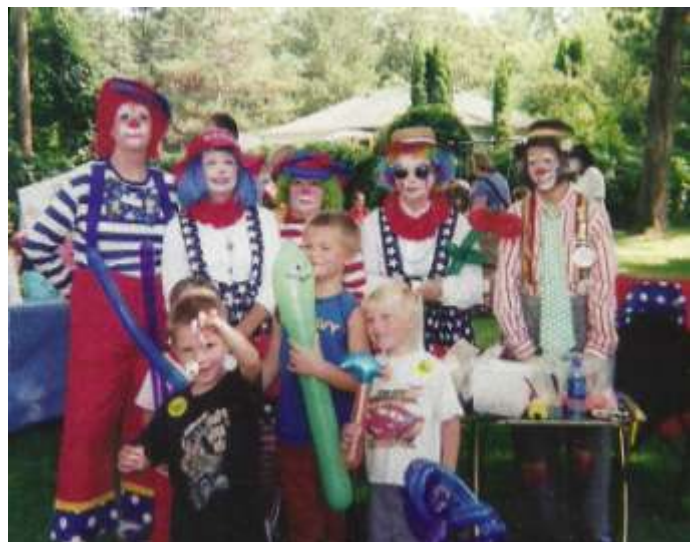
Lino Lakes Lioness Clowns @ Stacy Days- 8/7/10 Doing animal balloons in the park for the Stacy Lions