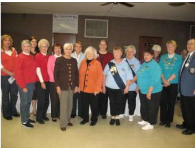
Group 2 Lioness presidents and secretaries who met in St Francis on October 13.