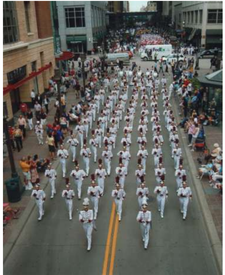
Fergus Falls Marching Band at the International Convention in MPLS on the Nicollet Mall in 2009

The Fergus Falls High School band program has a long tradition of excellence on the local, state and national levels. Recently the Fergus Falls High School Marching Band was honored with an appearance in the historic 2009 Presidential Inaugural Parade as the sole representatives of Minnesota. In the fall of 2009 the band became the first ever high school band to perform in the University of Minnesota Homecoming Parade. Other honors have included three appearances in the International Lions Parade, with a 1st place finish at Boston in 2006 and 2nd place in Minneapolis in 2009. The band also received 2nd place finish in the National Cherry Blossom Parade in Washington D.C. The band members, Fergus Falls High School, and the community of Fergus Falls all take pride in the Fergus Falls High School Marching Band. With each performance the band members hope that you too will "Share The Pride."