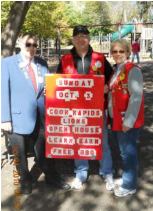
Coon Rapids Lions welcome the community to their Open House in the Park 10/3/10