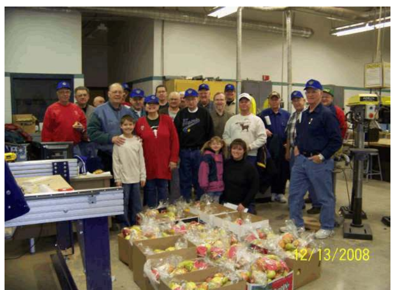
The Rush City Lions held their annual Fruit Basket Event on Saturday, December 13th. They delivered over 320 fruit baskets to members of the Rush City community and spread a little holiday cheer.